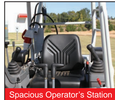
Spacious Operator's Station