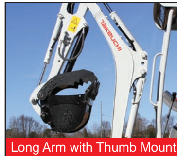
Long Arm with Thumb Mount