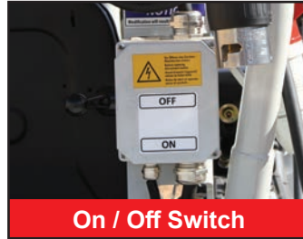
On / Off Switch