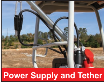
Power Supply and Tether