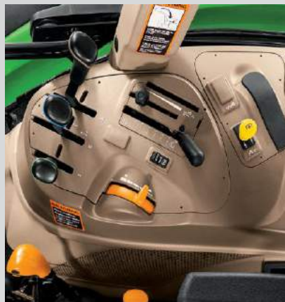
The conveniently located console makes operating the hitch intuitive. Raise and lower the hitch with the control lever and set the stop knob for preset depth.