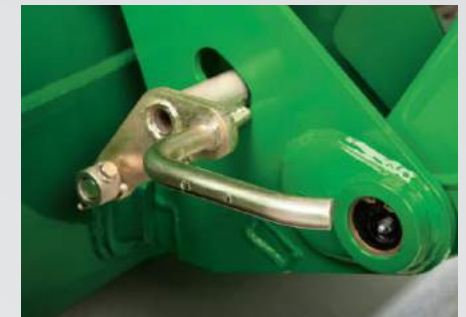
The global carrier – with its single lever for attachments – helps you move from job to job quickly.