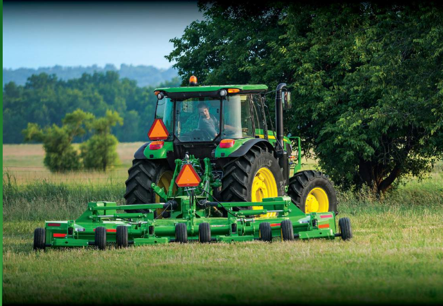
Take on a wide range of PTO-powered jobs with the 540/1000 RPM independent PTO system.

The electrohydraulic engagement system allows you to power the PTO up or down with one simple move. Because the PTO is fully independent, you can handle tough, start-and-stop conditions. It keeps the power flowing whether you're clutching, stopping or changing gears. And switching from 540 to 1000 rpm takes less than 30 seconds, making it easy to handle any implement you've got ... even those requiring higher power within a constant power range.