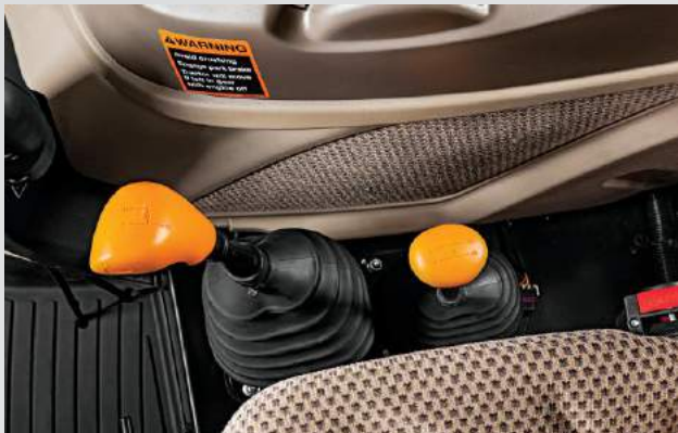
Shift on the fly: Don't stop to change gears. The 6E transmissions are synchrozed when shifting from B to C, C to D and D to C ranges