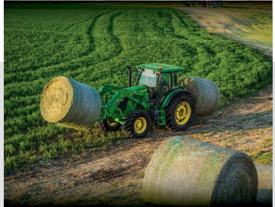
With 3,946 pounds (1789 kg) of lift capacity, an H Series Loader handles round bales ... and can even lift and stack two 5X6 bales easily.