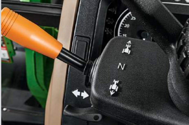
The PowrReverser helps you smoothly change directions without needing to change gears or touch the clutch ... a must have for fast loader work.