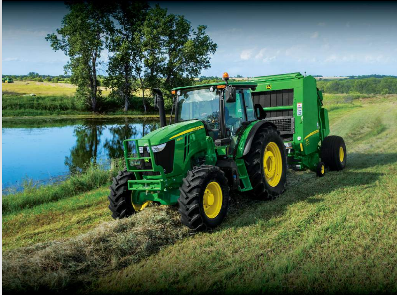
Get 11 speeds in the working range of 5 to 13 miles per hour (8 to 20 km/h) and a top transport speed of 25 mph (40 km/h) with the optional 24/12 transmission.