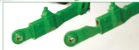
Telescoping draft arms make implement hook up faster and easier.