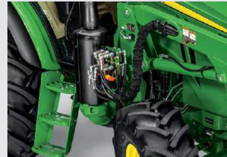
Concealed oil lines improve visibility and protect the hydraulic system from damage.