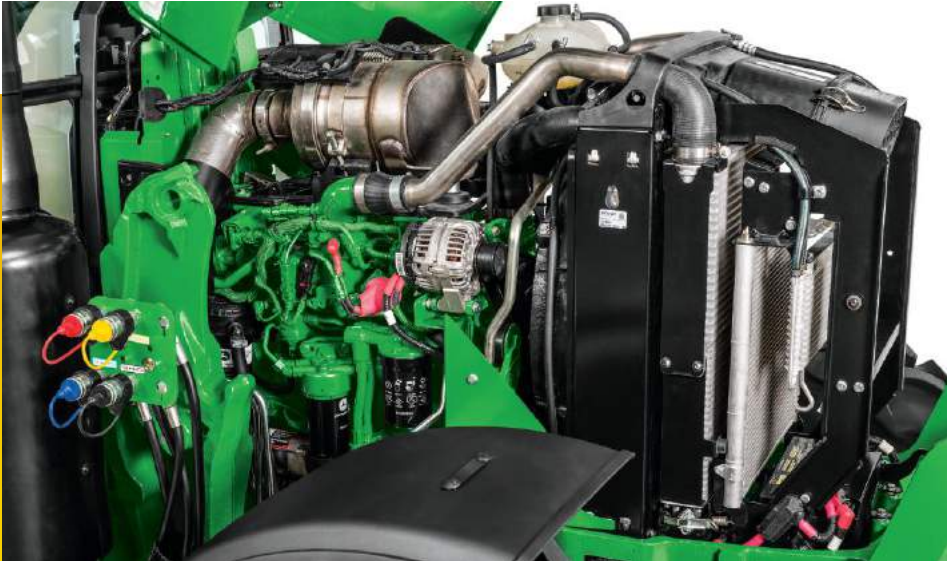
Low cost of operation goes beyond fluid economy. The 6E maintains the low cost of maintenance that made the 6D so popular.