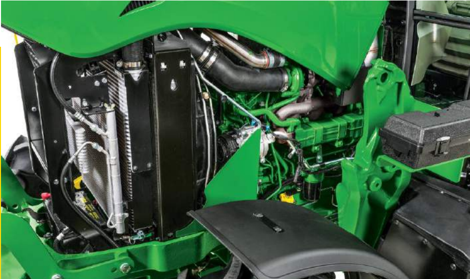
Simple to service ... it's a big part of the 6E value story. Regular maintenance checks are easy so you can get on the job quick. The lifetime DPF filter won't require costly or time-consuming replacement either.

Every 6E Series Tractor is backed by the trusted John Deere name ... and a two-year, 2,000-hour warranty. ±