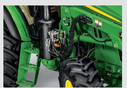
Concealed oil lines improve visibility and protect the hydraulic system from damage.