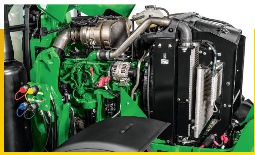
Low cost of operation goes beyond fluid economy. The 6E maintains the low cost of maintenance that made the 6D so popular.