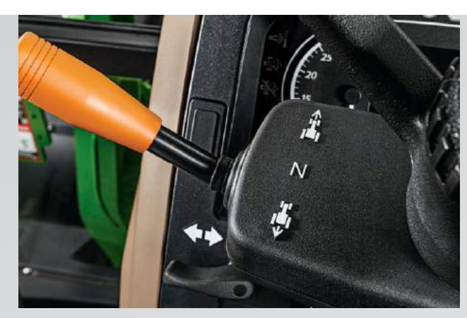
The PowrReverser helps you smoothly change directions without needing to change gears or touch the clutch ... a must have for fast loader work.