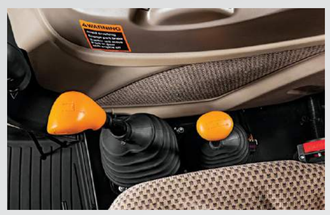
Shift on the fly: Don't stop to change gears. The 6E transmissions are synchrozed when shifting from B to C, C to D and D to C ranges