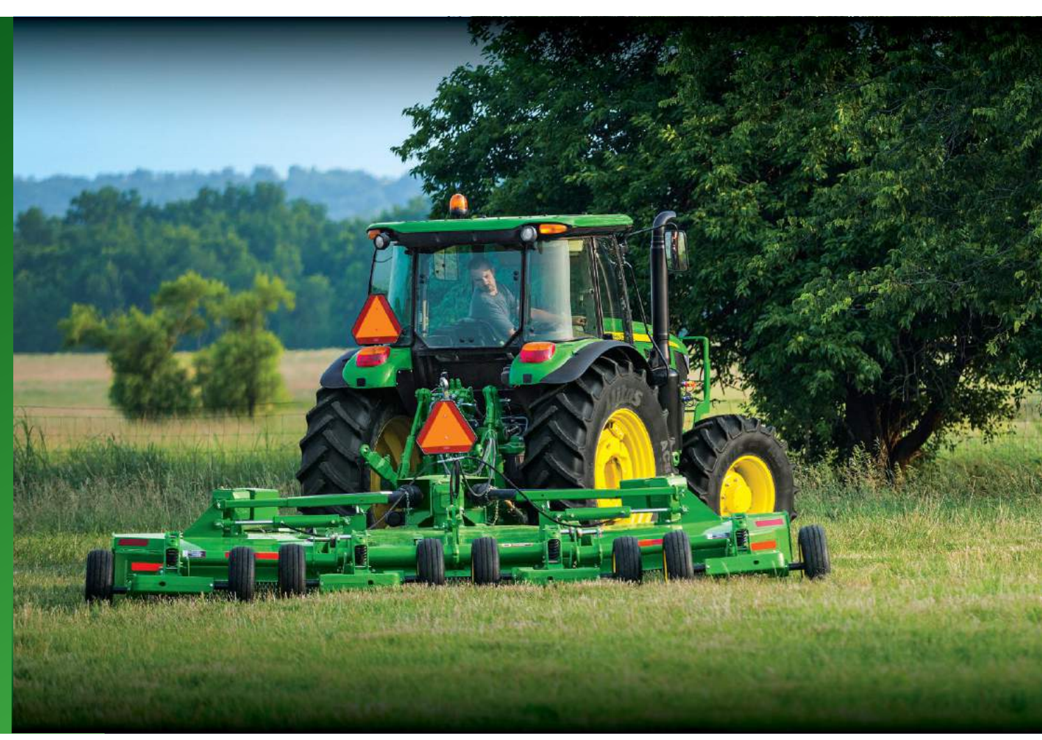
Take on a wide range of PTO-powered jobs with the 540/1000 RPM independent PTO system.

The electrohydraulic engagement system allows you to power the PTO up or down with one simple move. Because the PTO is fully independent, you can handle tough, start-and-stop conditions. It keeps the power flowing whether you're clutching, stopping or changing gears. And switching from 540 to 1000 rpm takes less than 30 seconds, making it easy to handle any implement you've got ... even those requiring higher power within a constant power range.