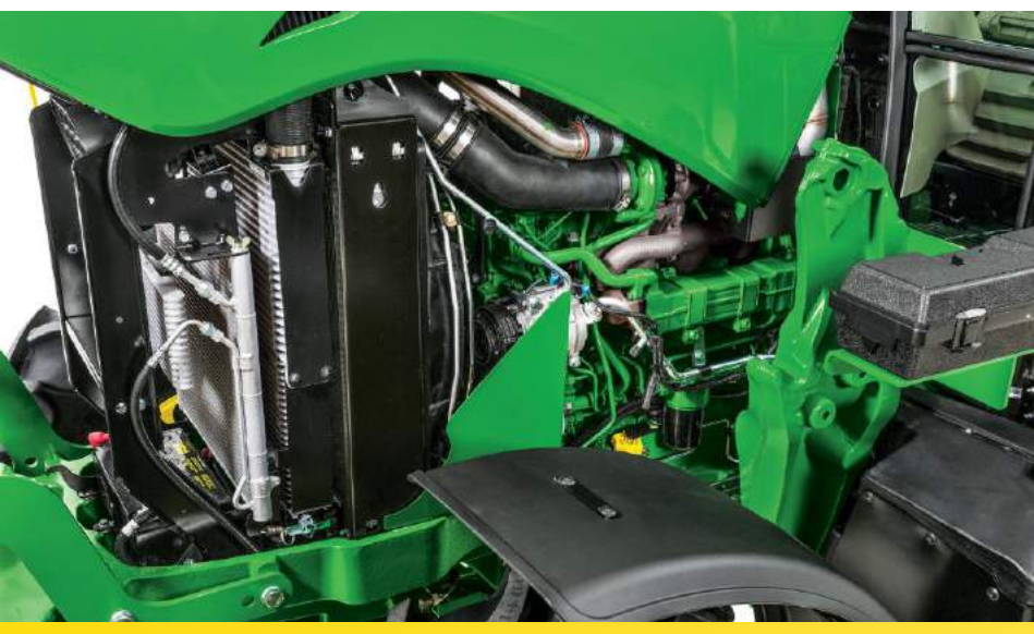
Simple to service ... it's a big part of the 6E value story. Regular maintenance checks are easy so you can get on the job quick. The lifetime DPF filter won't require costly or time-consuming replacement either.

Every 6E Series Tractor is backed by the trusted John Deere name ... and a two-year, 2,000-hour warranty.*