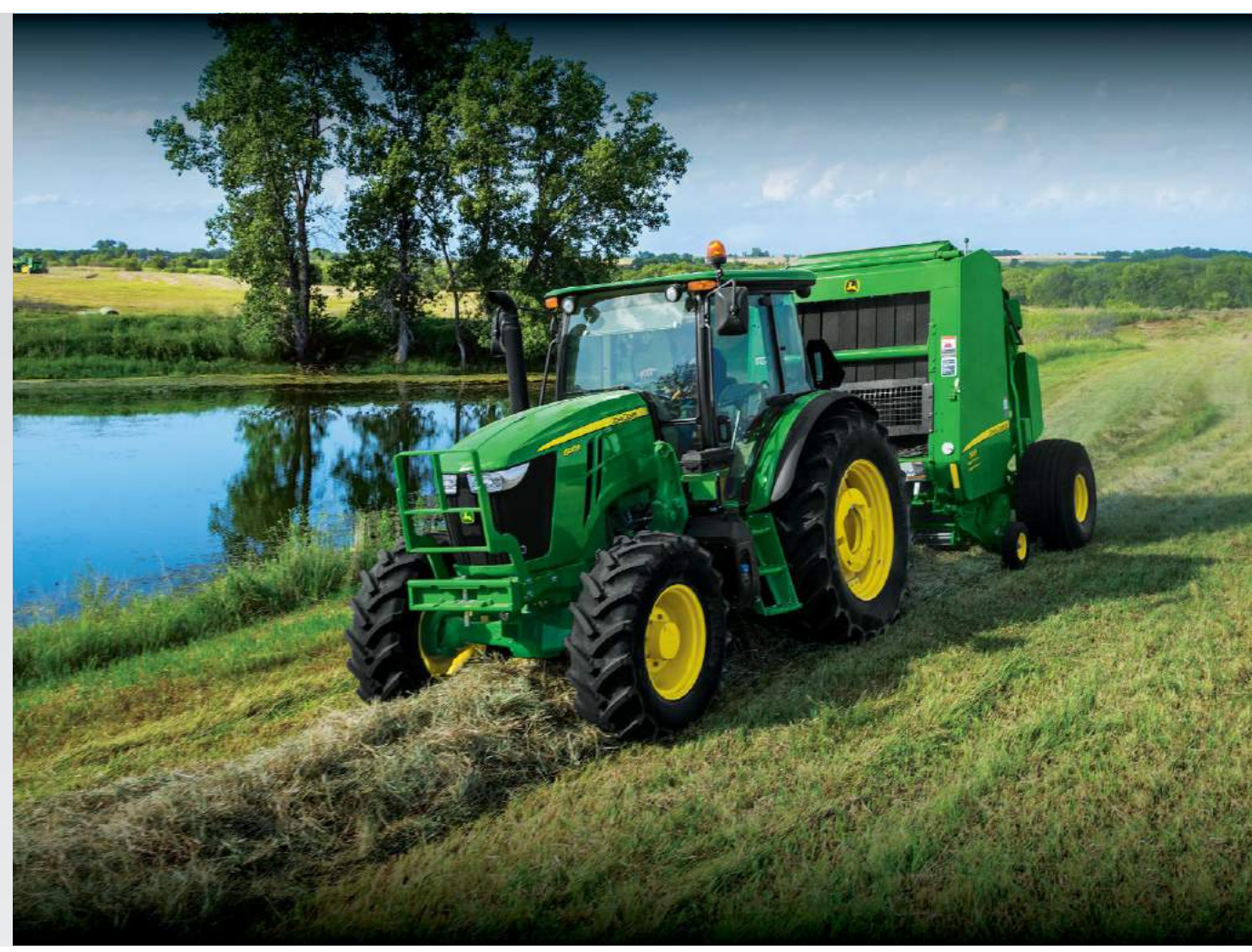
Get 11 speeds in the working range of 5 to 13 miles per hour (8 to 20 km/h) and a top transport speed of 25 mph (40 km/h) with the optional 24/12 transmission.