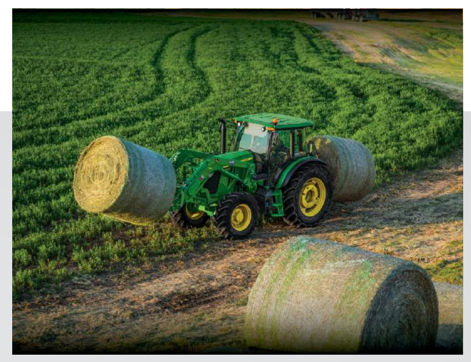
With 3,946 pounds (1789 kg) of lift capacity, an H Series Loader handles round bales \, ... \, and can even lift and stack two 5X6 bales easily.